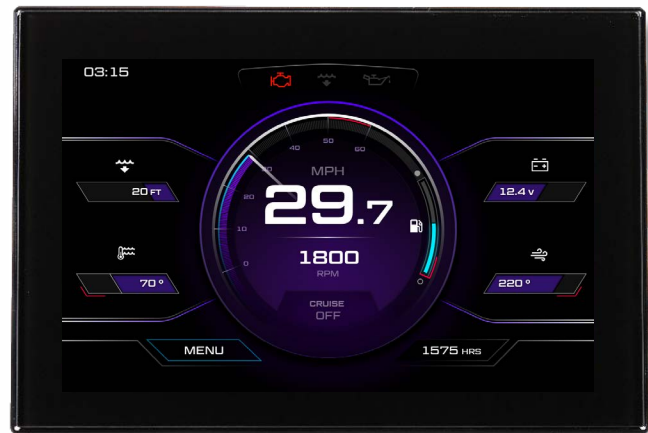
NOT ACTUAL DISPLAY, FOR REFERENCE ONLY

Bonded glare-free LCD screen for superior visibility in sunlight